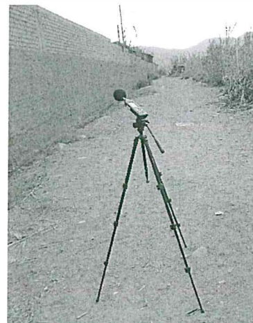
Punto de Monitoreo RU-IPSA 04