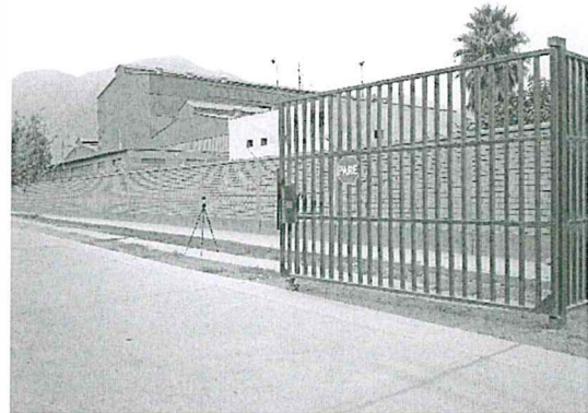
Punto de Monitoreo RU-IPSA 02