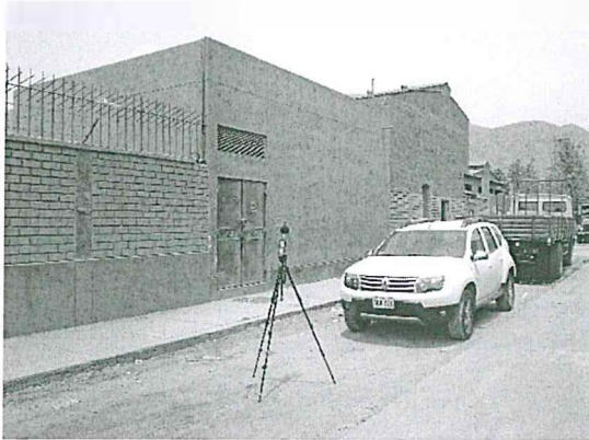
Punto de Monitoreo RU-IPSA 01