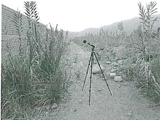
Punto de Monitoreo RU-IPSA 03